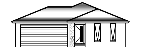
FACADE TYPE 1