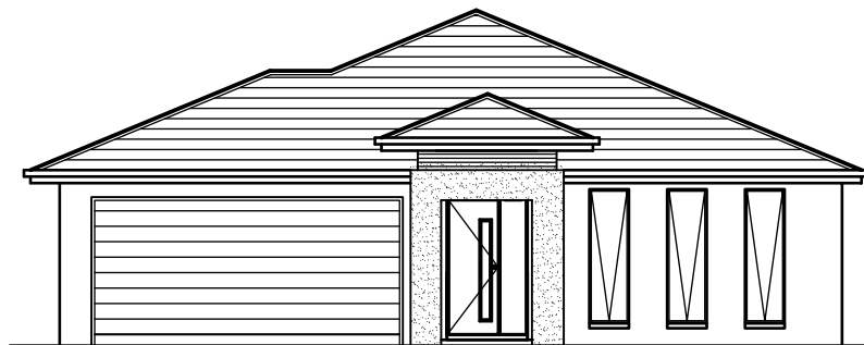
FACADE TYPE 1