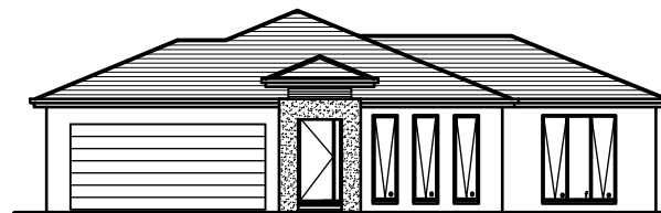
FACADE TYPE 2