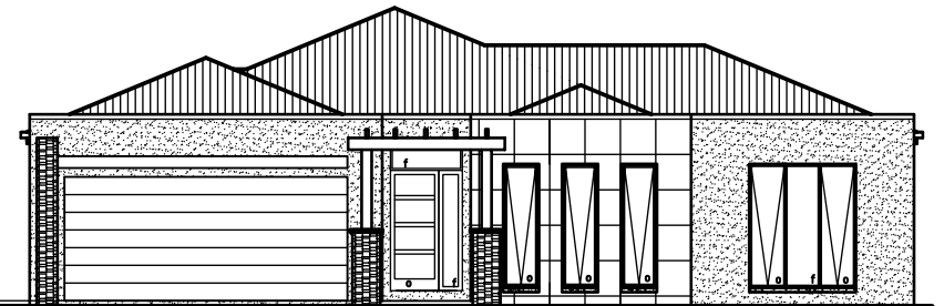
FACADE TYPE 3 (AS PER THE DISPLAY)