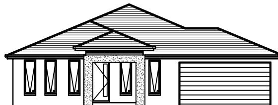
FACADE TYPE 1