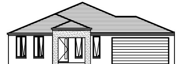
FACADE TYPE 3