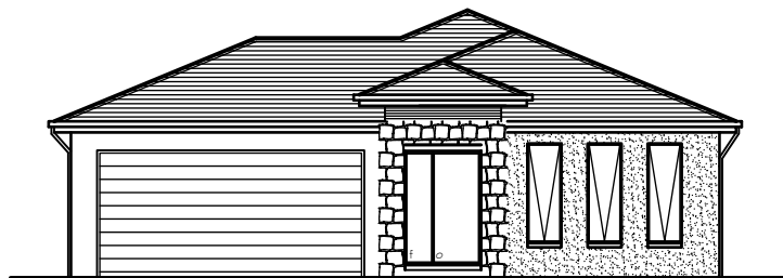
FACADE TYPE 1 (AS PER FLOOR PLAN DESIGN)