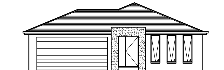
FACADE TYPE 2